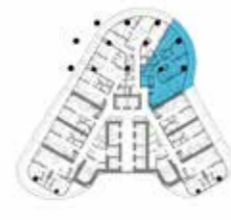
LEVELS: 3,8,9,14,15,20, 26,27,32,33,38,39