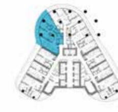
LEVELS: 5,6,11,12,17,18, 23,24,29,30,35,36,41,42